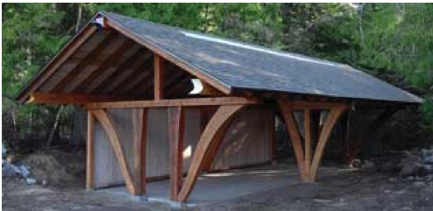
The outdoor classroom constructed using wood from HPFP

Located on Redfish Creek across from the school, the stylish structure will be used by students for outdoor studies/activities when the weather is appropriate. The school is hosting a Grand Opening on Friday, June 8 at 1:00 p.m. Members of the community are welcome to attend.