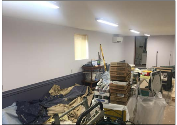
Nearly completed renovations in the building's main room

Additionally, a second free firewood event was held. HPCC donated approximately three logging trucks worth of firewood that had been decked over the winter at various locations. The mill added nine dump truck loads of older saw logs, so there was plenty of firewood available for all. It was held at the Harrop Hall over the last weekend of May and throughout the following week. The Harrop & District Community Centre Society (HDCC) received $750 worth of donations from those cutting and hauling, as well as a donation from HPCC towards cleanup costs - a lot of bark and sawdust to be raked up!