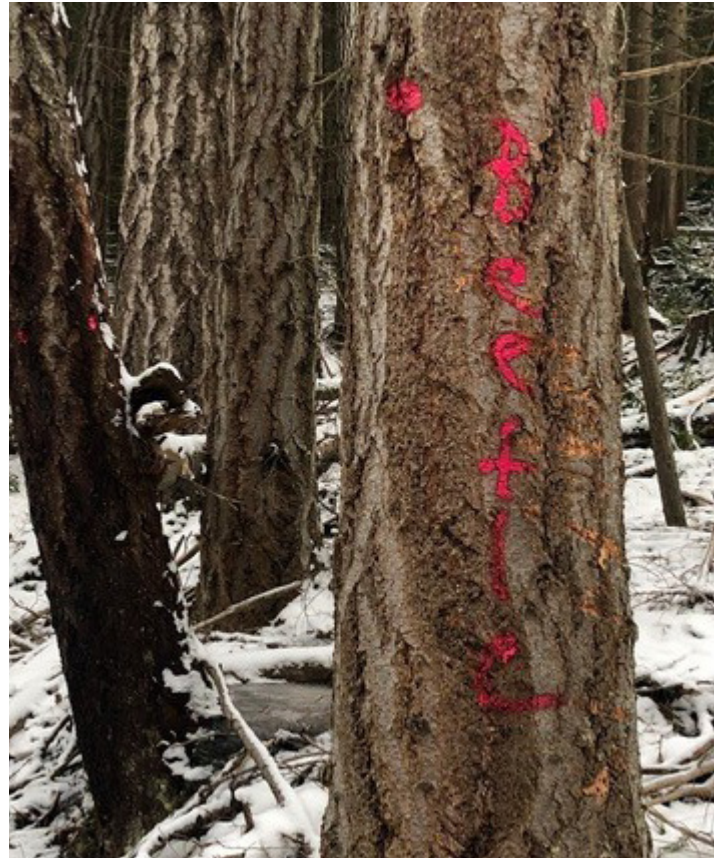
Beetle infested trees in the Procter area.

A key objective of the community forest is to diversify and improve the resilience of our forests over time. While many trees will undoubtedly succumb to beetles, drought, and other issues, we will continue to work at reducing risks and promoting ecological health.