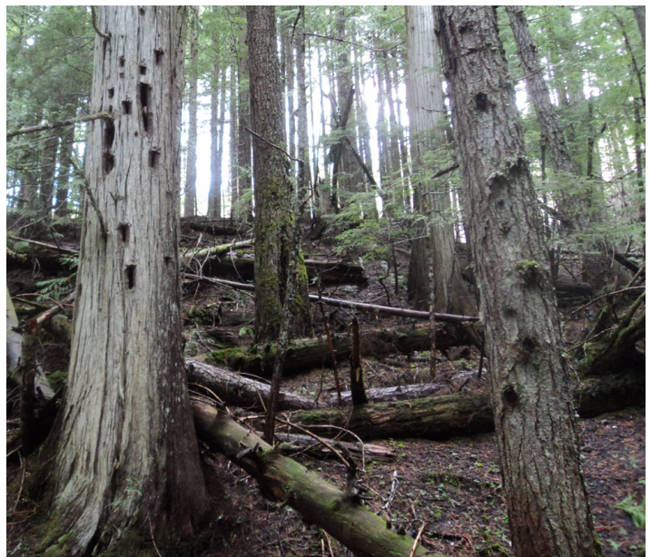
Moist forest located in HPCC reserve network

Regrettably, moist or wet forests at low elevations are relatively uncommon in our community forest. This is unfortunate as they are critically important for biodiversity, water protection, and carbon storage. These forests are protected by inclusion in HPCC's network of reserves.