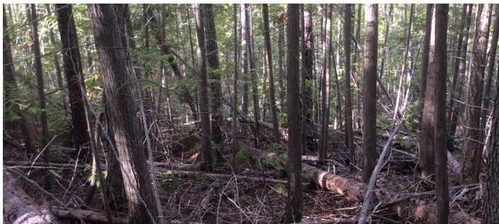
Typical forest conditions and fuel loads above Harrop

The vast majority of forests in the Harrop-Procter area originated from very large fires in the early 1900's and are now very dense with high fuel loads. These are unnaturally high due to 80 years of fire suppression, and fire risks are generally high to very high near our community. Fuel breaks include forests that have been thinned to significantly reduce understory fuels and create canopy gaps so that a wildfire will burn at lower intensity. Access is deliberately planned to facilitate fire control efforts in the event of an approaching wildfire.