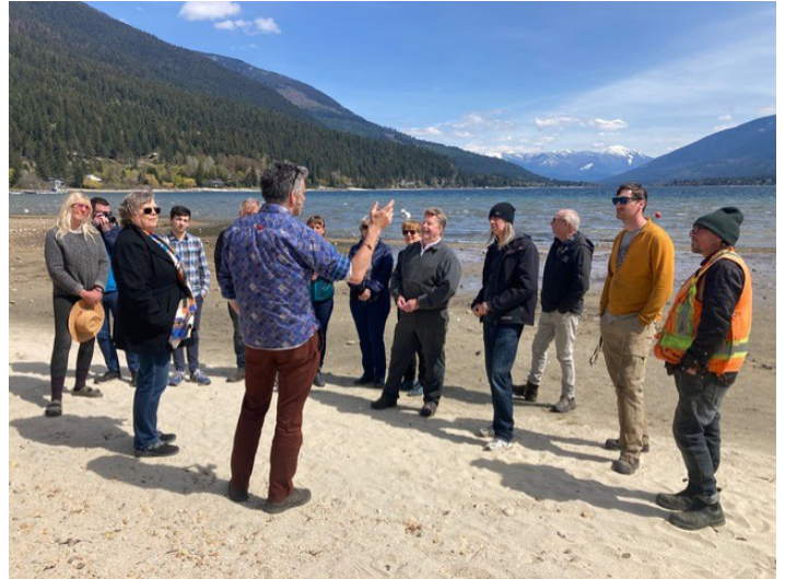
HPCC staff and board members with MLA's at Kokanee Park